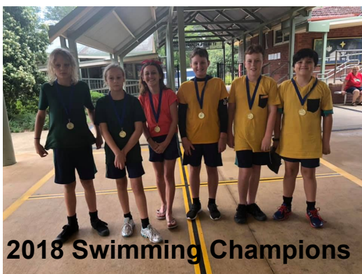
2018 Swimming Champions